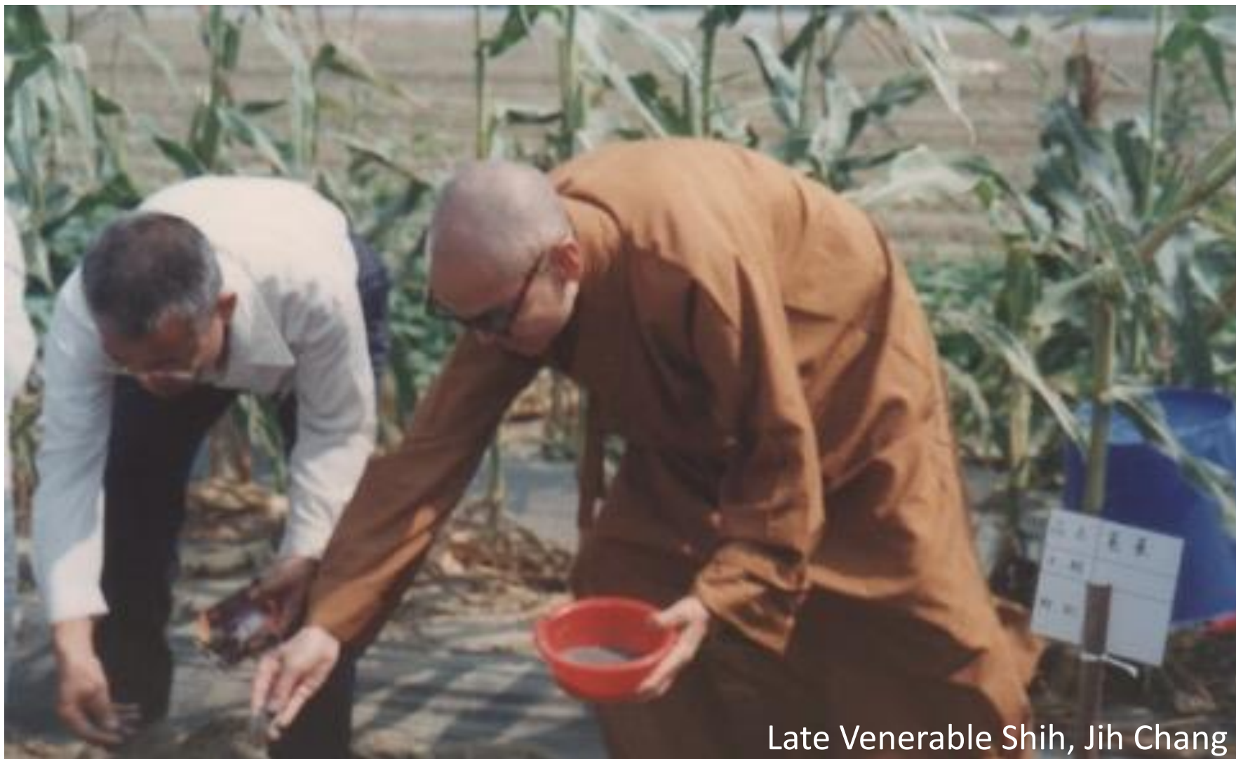
Late Venerable Shih, Jih Chang