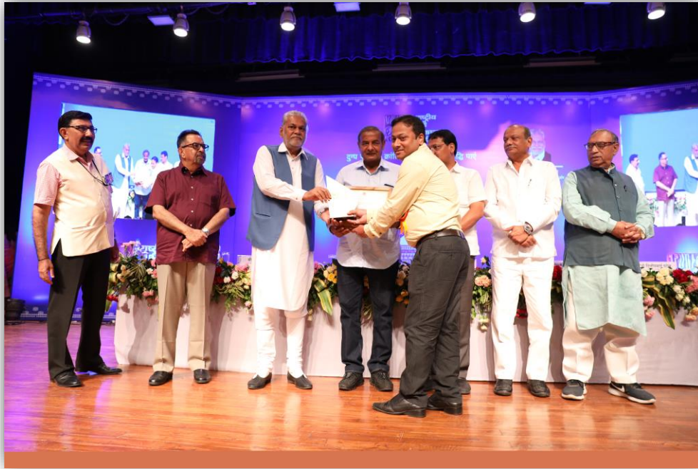
National Dairy Development Board, India