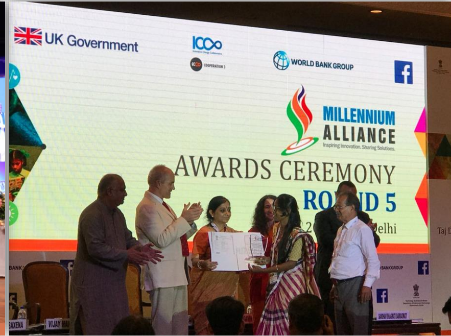
Federation of Indian Chambers of Commerce and Industry, India