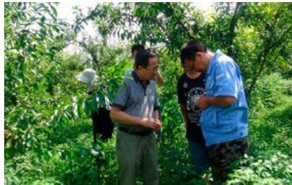
Field Training on pest control