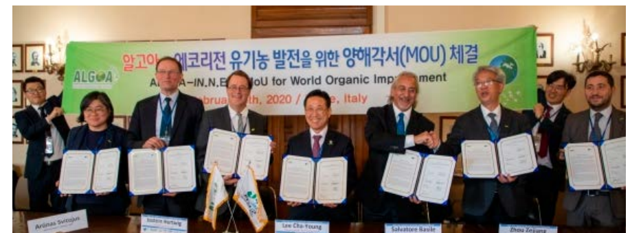
(Feb 6th, 2020 - Rome, Italy, Ministry of Agriculture: MOU signing ceremony)

In the following months an intensive work has done to put the agreement into practice and on Feb 6th, 2020, at the Italian Ministry of Agriculture in Rome, ALGOA signed a first Memorandum of Understanding with the International Network of Eco-Regions (IN.N.E.R.), supported by IFOAM-Organics International, IFOAM Asia, IFOAM EU, the Baltic Foundation of Lithuania and the Organic Food System Program, for future cooperation.