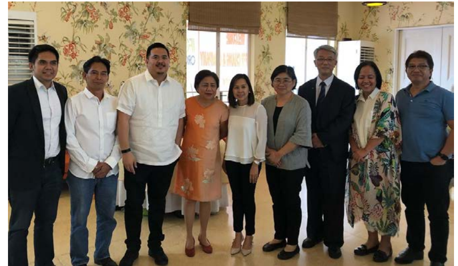
(Photo Credit: LOAMCP-Ph / Members of LOAMCP-Ph and IFOAM Asia with Senator Cynthia Villars)

In the strictest sense, the small organic family farm practitioners are deprived of their rights to affordable organic certification. As early as 2011, the PGS Pilipinas strongly advocated the amendment of the National Organic Agriculture Policy Framework or the Republic Act 10068 for the inclusion and recognition of PGS. The network submitted the position paper in 2013 to National Organic Agriculture Board with the support of the IFOAM-Organics International for the recognition of PGS.