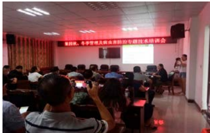
A Training Session