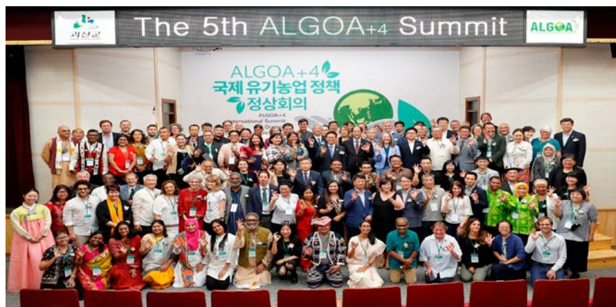
5th ALGOA+4 Summit, with more than 100 delegates from all over the world

Currently, ALGOA has over 220 members in 16 countries in Asia and Central Asia. Annual events include the Organic Foundation Course (OFC) for local government officers and organic stakeholders as well as the ALGOA Summit which bring together local government leaders and organic stakeholders to discuss and share best practices and find common solutions for the progress of the organic sector.