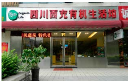
Xichong Organic Shop in Beijing