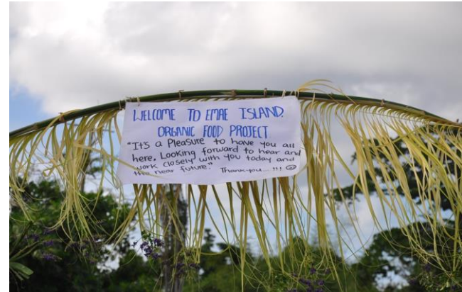
Emae island, Vanuatu