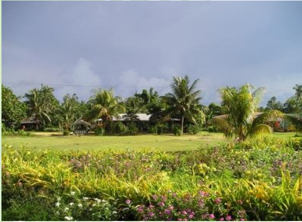
Sili village, Samoa