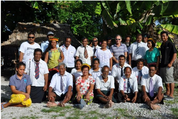
Abaiang Island, Kiribati