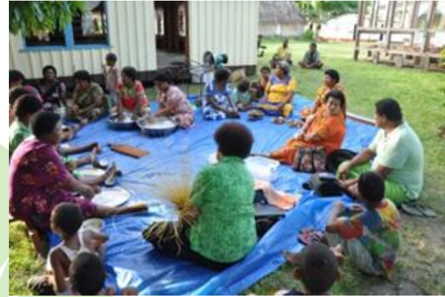
Cicia Island, Fiji